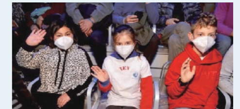
Children invited to see the games