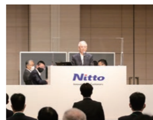
The 157th Ordinary General Meeting of Shareholders

* The 157th Ordinary General Meeting of Shareholders was held with due cautions given to COVID-19.