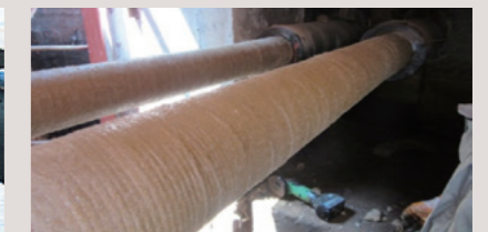
Anti-corrosion of piping in the pit.