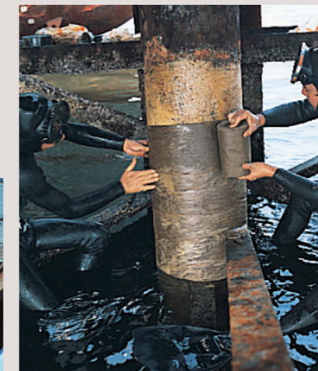
Anti-corrosion for marine structure.