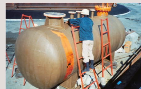
Anti-corrosion for outside of underground tanks.