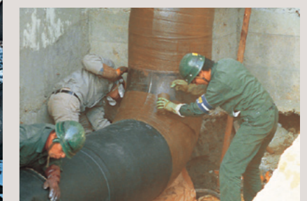
Anti-corrosion of buried steel coolant pipes.